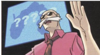
Phase 2 : "???" 10 Questions