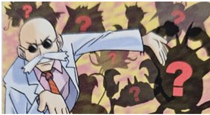
Phase 1 : "???" 10 Questions