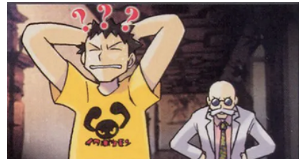
Phase 3 : "???" 10 Questions